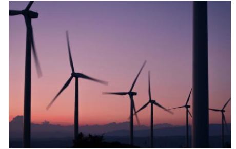
Energy and utilities