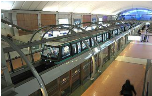
Transport and mobility