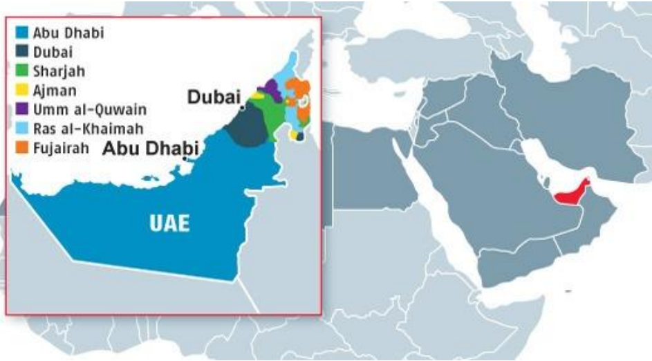
Figure 2: Maps of the UAE in the Gulf region, and of the seven emirates. (Sources: MEED 2014)

The UAE is a young nation established in 1971 by Sheikh Zayed bin Sultan Al Nahyan and is composed of seven emirates: Abu Dhabi, Dubai, Sharjah, Ajman, Umm Al Quwain, Fujairah, and Ras Al Khaimah, as shown in Figure 2 below. The UAE is a member of the Gulf Cooperation Council (GCC), which also includes the states around the Arabic Gulf of Bahrain, Kuwait, Oman, Qatar, and Saudi Arabia.