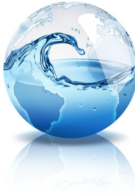
jpg